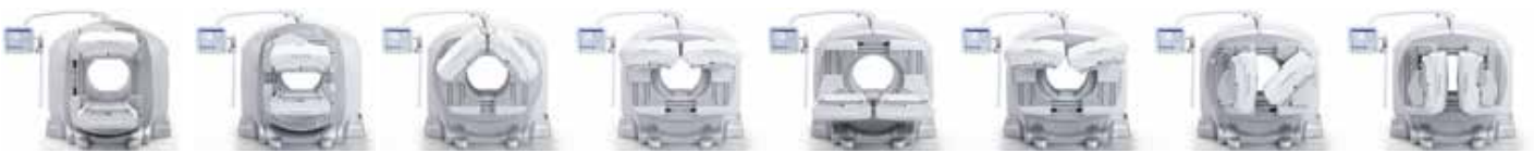
Main programmed orientations of Discovery NM/CT 670 Pro gantry